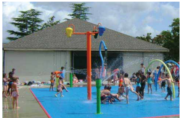
Laurens County, GA: $175,000