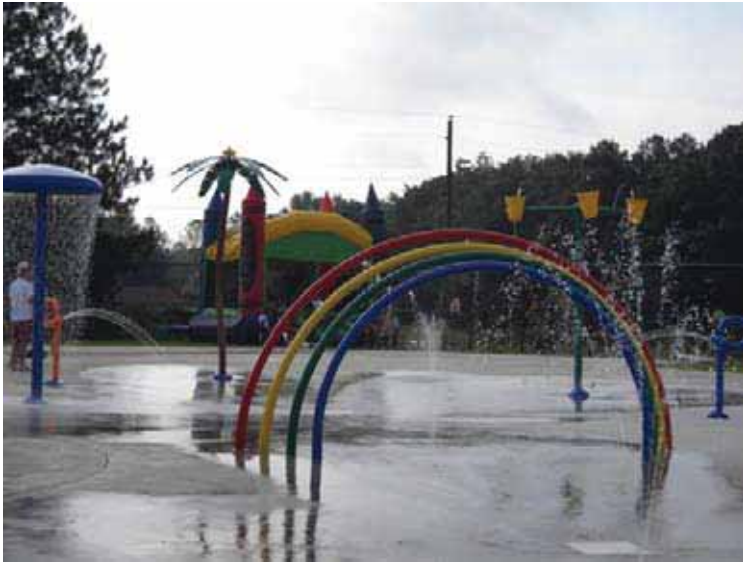
Sumter County, GA: $246,000