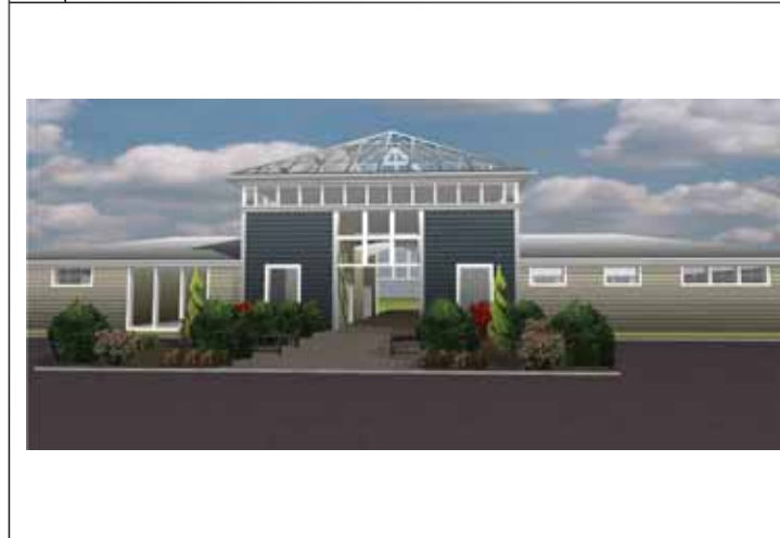
B ARCHITECTURAL RENDERING (FRONT ELEVATION) NO SCALE