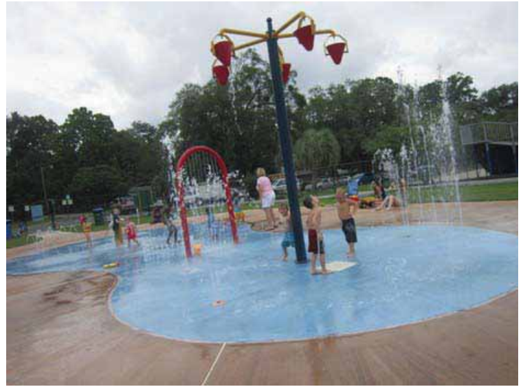
Alachua County, GA: $145,000