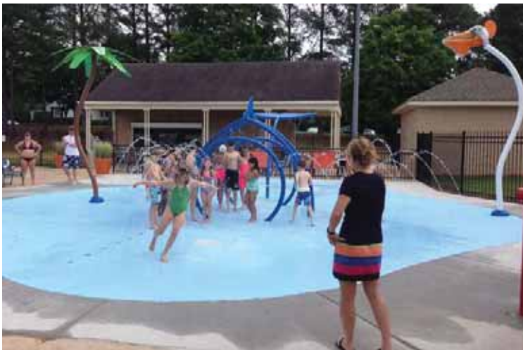
Fulton County, GA: $214,000