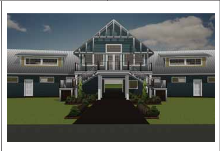
C ARCHITECTURAL RENDERING (FRONT ELEVATION) NO SCALE