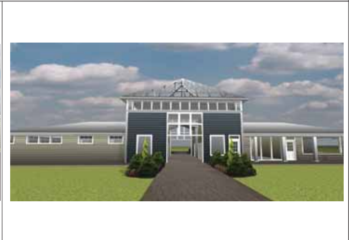
C ARCHITECTURAL RENDERING (BACK ELEVATION) NO SCALE